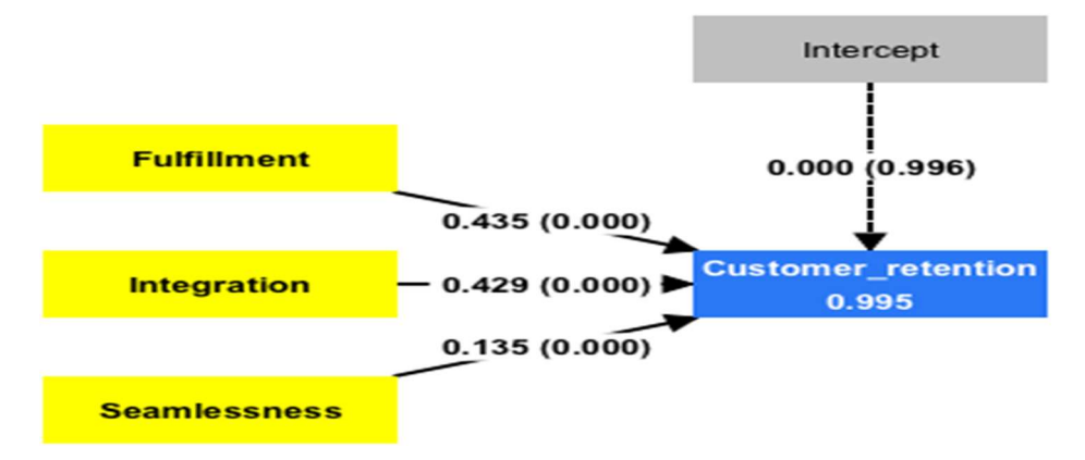
Figure (2) Multiple regression model (1) of omnichannel strategies on customer retention

In order to test the measurement model of variables (Integration seamlessness - Fulfillment), the Partial Least squares (PLS) was used by using SmartPLS 4.0 program, as figure (2) shows the relationship between Omnichannel Retailing Strategies on Customer Retention