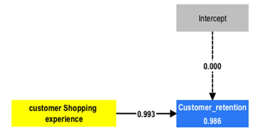
Figure (3) Multiple regression model (2) of customer shopping experience on customer retention

H4 predicts that Customer shopping experience has a positive effect on customer retention.